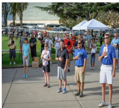
2015 - ACC Annual Golf Event