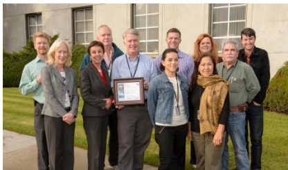
ACC USRA Contractor Award